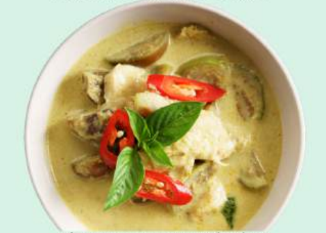
Thai Green Curry Chicken