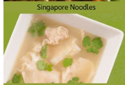
Short Soup (Won Ton)