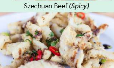
Salt & Pepper Squid