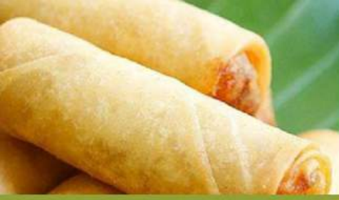
Vegetarian Spring Rolls