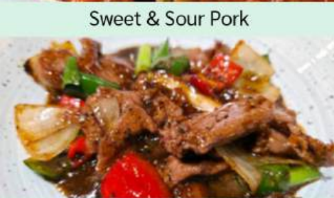
Beef with Black Pepper