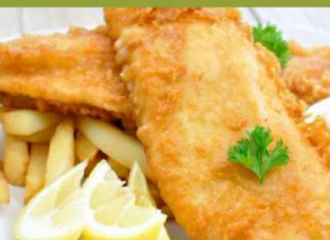
Beer Battered Fish & Chips