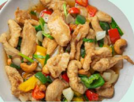
Chicken with Seasonal Vegetables in Garlic Sauce