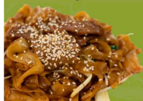
Flat Rice Noodles with Beef