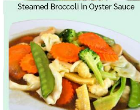
Stir Fried Mixed Vegetables