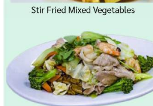
Combination & Vegetables