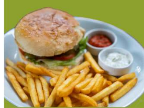
Cowboy Burger with Chips