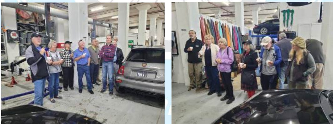
Just some of the happy members.