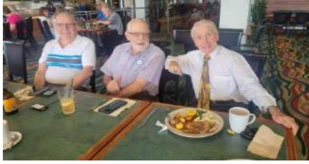
Roscoe doing some entertaining.

All in all a very interesting and enjoyable day...a good time was certainly had by all.