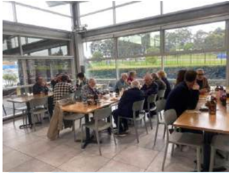
Some of the crew dining.

Once the meals started to roll out the conversations slowed a little as we all managed to put away the variety of food and cakes that were on offer.