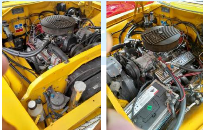
The heart of the matter!

The result was that at 106000 miles a crate Chev 5.7 V8 motor and a Turbo 700 transmission gear box was fitted to rectify the power to weight ratio. The drum brakes were replaced with disc brakes all round along with the addition of power steering and air conditioning !